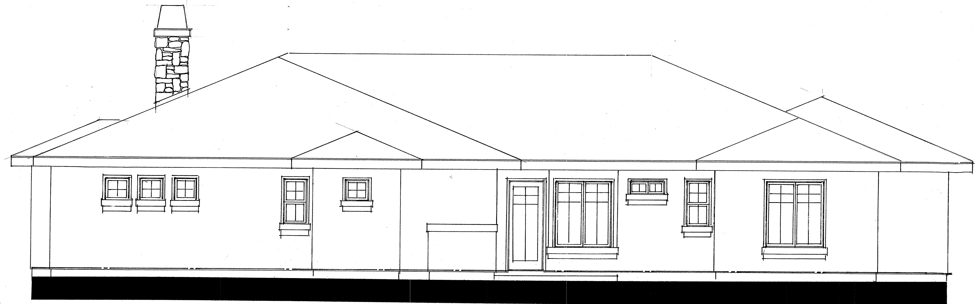
Rear Elevation Scale: 1/4" = 1'-0"

This drawing is considered proprietary. It is not to be reproduced, nor is the information contained to be used to produce products, unless written consent is first obtained from Crystal Creek Homes, Inc.